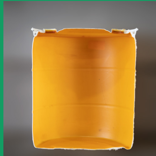
Inside stained but rinsed clean