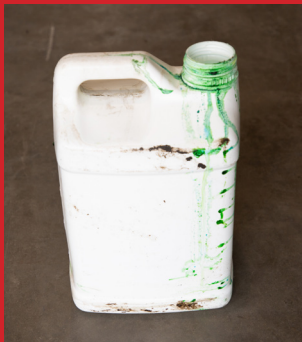
Dried formula on container