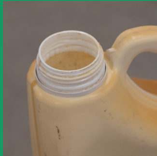
Handle and neck stained but clean