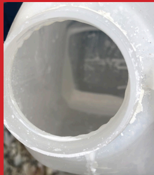
Dried formulation on thread