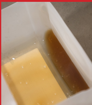
Liquid residue in container