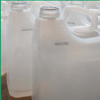
Container, thread, and lip are clean