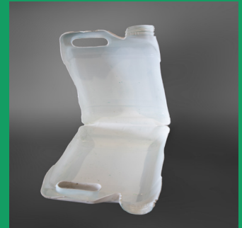
Inside is clean and dry